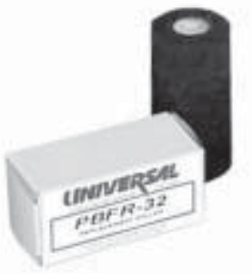
PRESS BUTTON FOUNTAIN REPLACEMENT ROLLER