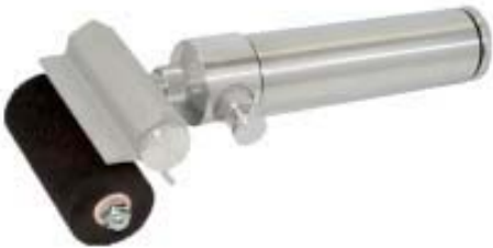
PBFR-31 PRESS BUTTON UNIT WITH PBFR-32 ROLLER

The Universal Press Button Fountain Roller is designed with a self-contained ink reservoir in the handle for efficient production stenciling applications. The refillable reservoir holds 4.2 oz. (125 ml) of ink and the precision valve delivers the ink directly to the surface of the roller with the press of a button. Since the Universal system delivers the ink direct to the roll surface, response time is almost instantaneous when more ink is needed on the stencil.